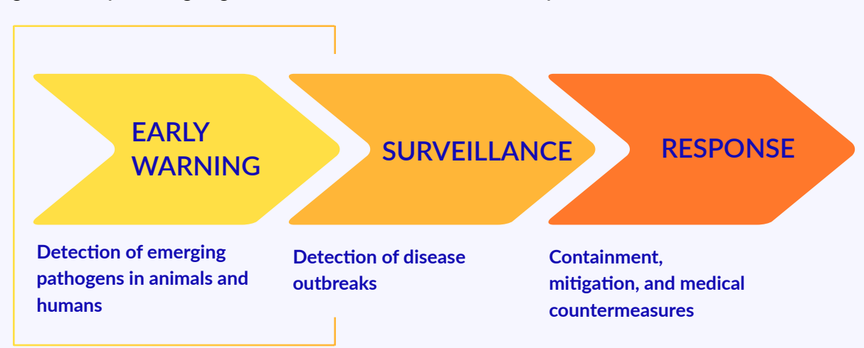
Figure 1. Early Warning Alignment in a Pandemic Prevention Ecosystem

The early warning system envisioned in this report would focus on detecting emerging pathogens in animals and humans and capturing outbreaks in humans at their earliest stage.